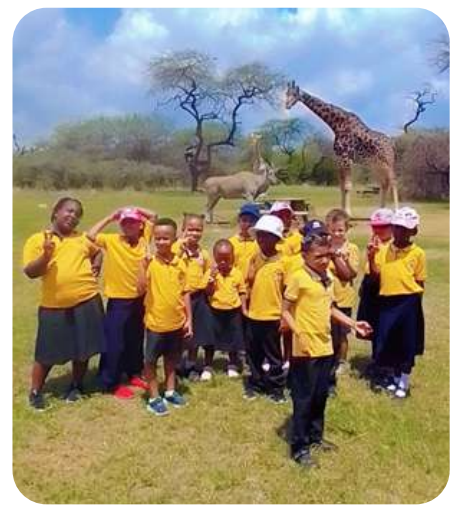
Meanwhile, Year 1 enjoyed a trip to Nguuni Sanctuary, discovering local wildlife and environmental conservation. These excursions provided hands-on learning and helped broaden students' understanding of both local culture and the natural world.