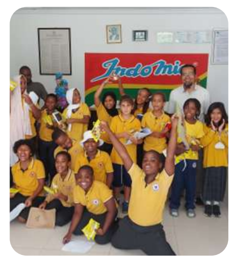
Year 4 students toured the Indomie factory and Jumba la Mtwana, gaining insight into food production and historical sites. Year 3 visited Wild Waters and Mamba Village, learning about wildlife and land rehabilitation. Year 2 explored Hauller Park, engaging with nature and outdoor activities.