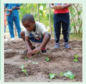
Vegetables are not only good for your health, but also for the environment and the community.